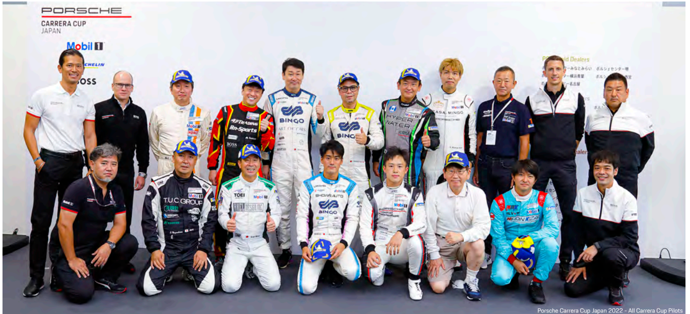
Porsche Carrera Cup Japan 2022 - All Carrera Cup Pilots