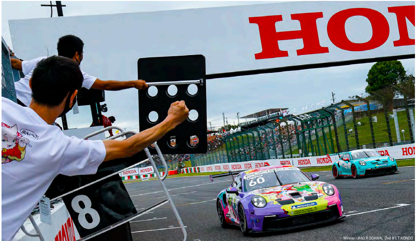
Winner: #60 R. OGAWA, 2nd #1 T. KONDO

Track condition: Cloudy / Dry, Air temp. 20°C, track temp. 23°C