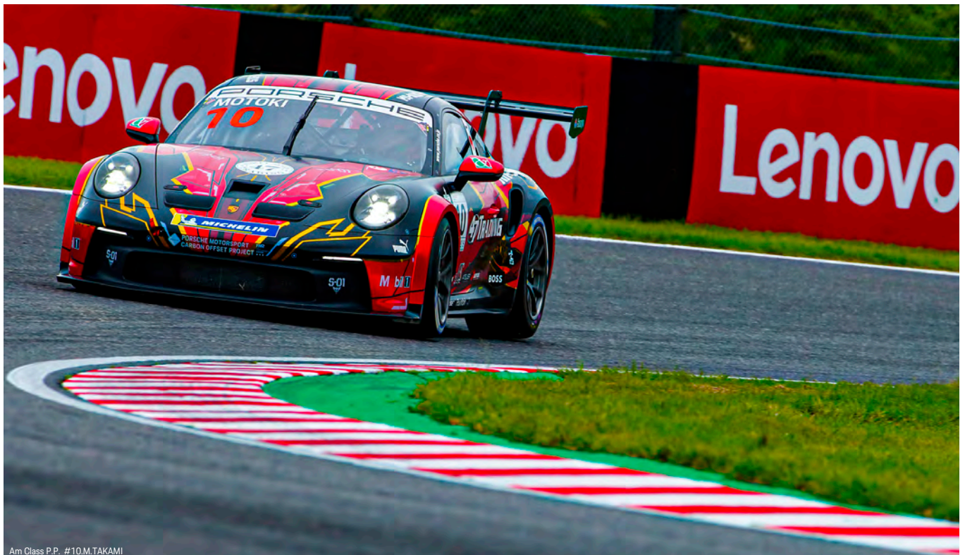
Am Class P.P. #10.M.TAKAMI