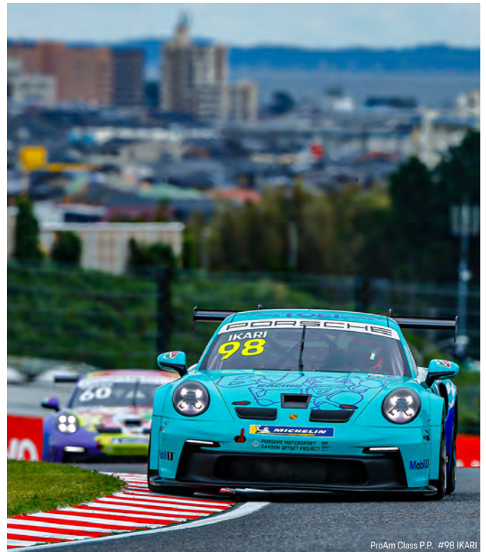
ProAm Class P.P. #98 IKARI

The 11th race, the final race of the PCCJ 2021 season, is scheduled to start at 11:05 am on Sunday, October 9th with 10 laps or within 30 minutes. Since this is the final race of the season and also the support race for the Formula 1 Japanese Grand Prix, all the drivers should be surely showing more enthusiasm than usual.