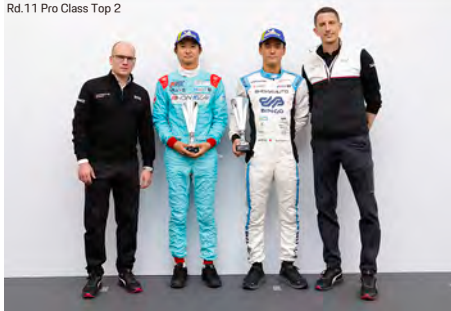
Rd.11 Pro Class Top 2