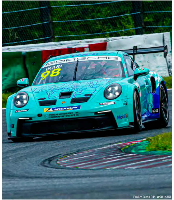
ProAm Class P.P. #98 IKARI

The 9th race of the season is scheduled to start at 16:55 on Saturday, August 27th with 15 laps or in 30 minutes while the 10th race is scheduled to start at 11:10 am on Sunday, August 28th, also running 15 laps or in 30 minutes. For your information, both the 9th and 10th races will be streamed live on the Porsche Japan Twitter account (@PorscheJP) on each day.