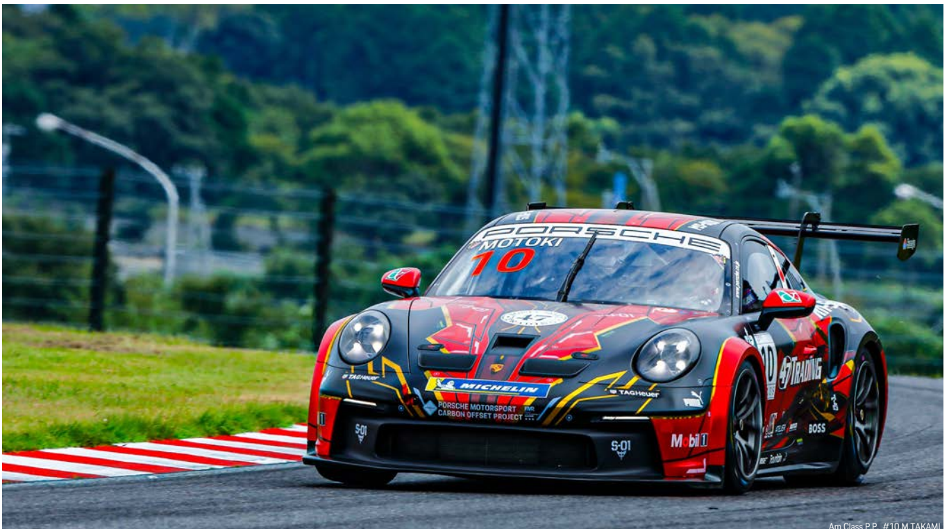
Am Class P.P. #10.M.TAKAMI