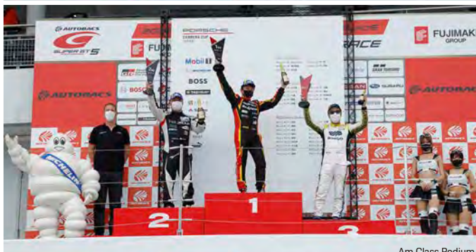
Am Class Podium