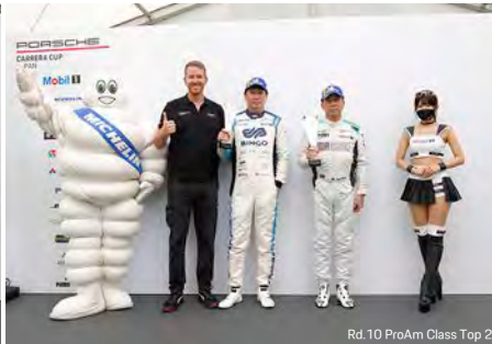
Rd.10 ProAm Class Top 2