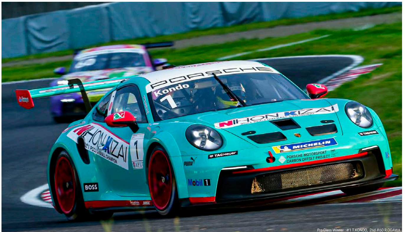
Pro Class Winner : #1 T.KONDO, 2nd #60 R.OGAWA