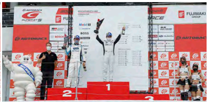
ProAm Class Podium