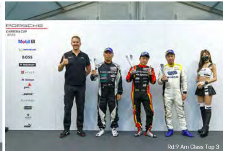
Rd.9 Am Class Top 3