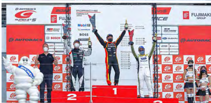
Am Class Podium