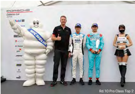
Rd.10 Pro Class Top 2