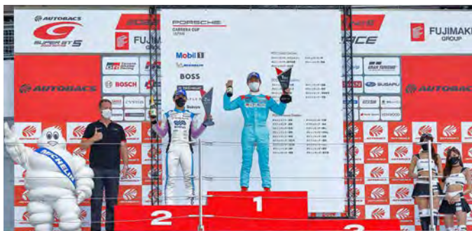
Pro Class Podium

* Black/White Flag (CarNo.60 : violated the track limit many times)