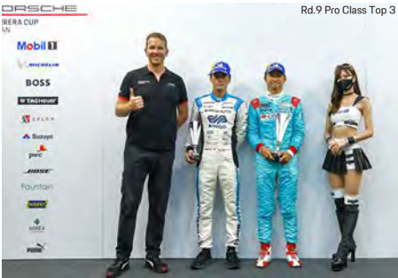
Rd.9 Pro Class Top 3