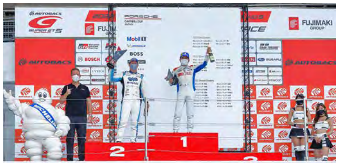
ProAm Class Podium