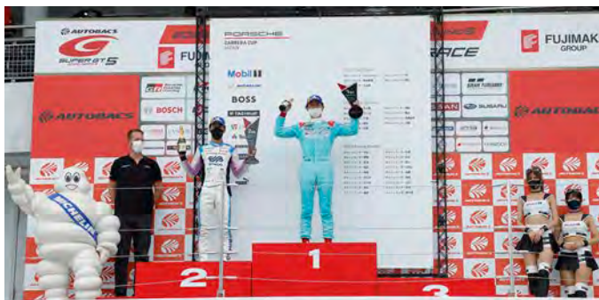
Pro Class Podium