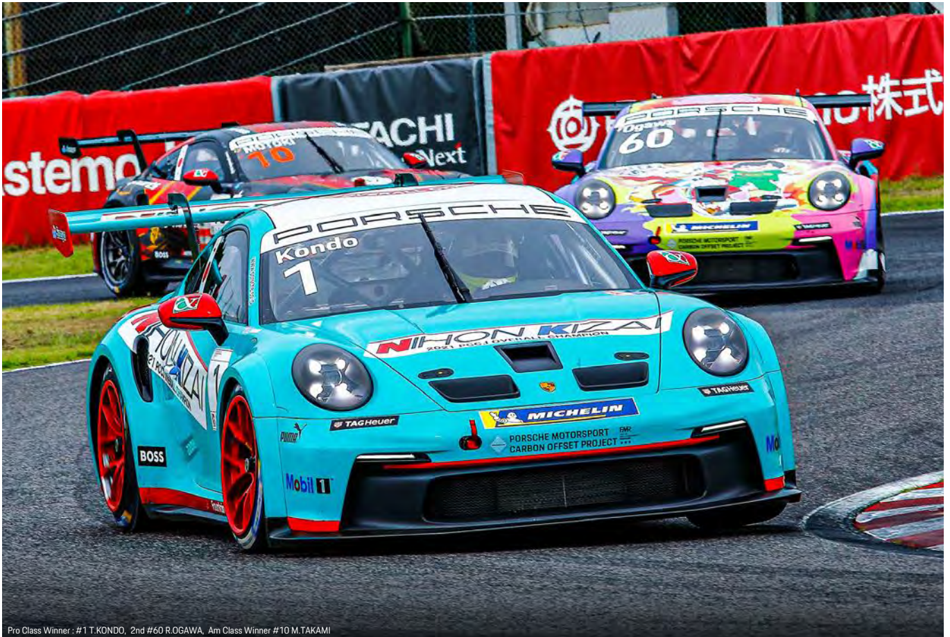
Pro Class Winner : #1 T.KONDO, 2nd #60 R.OGAWA, Am Class Winner #10 M.TAKAMI

Track condition: Cloudy / Dry, Air temp. 31°C, Track temp. 37°C