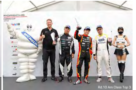
Rd.10 Am Class Top 3