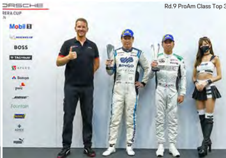
Rd.9 ProAm Class Top 3