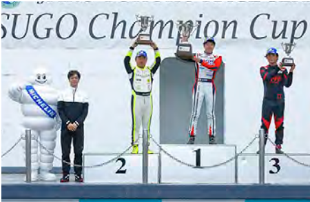
GT3-I Class Rd.4 : Top 3 Drivers