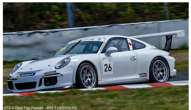
GT3-II Class Pole Position : #26 T.HASHIMURA