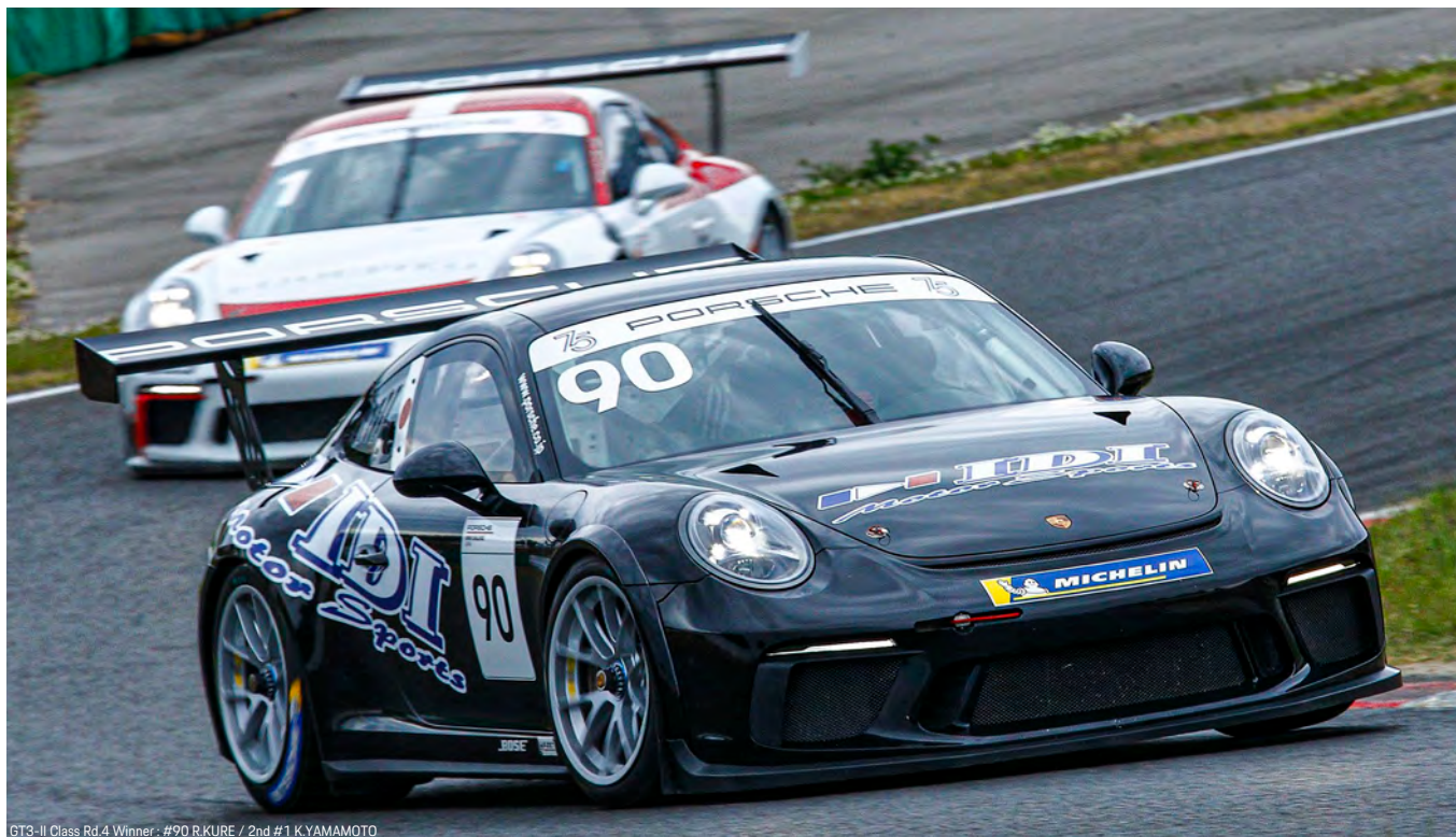
GT3-II Class Rd.4 Winner: #90 R.KURE / 2nd #1 K.YAMAMOTO

Started at 3:02 pm. / Weather : Sunny 19°C / Track : Dry 24°C