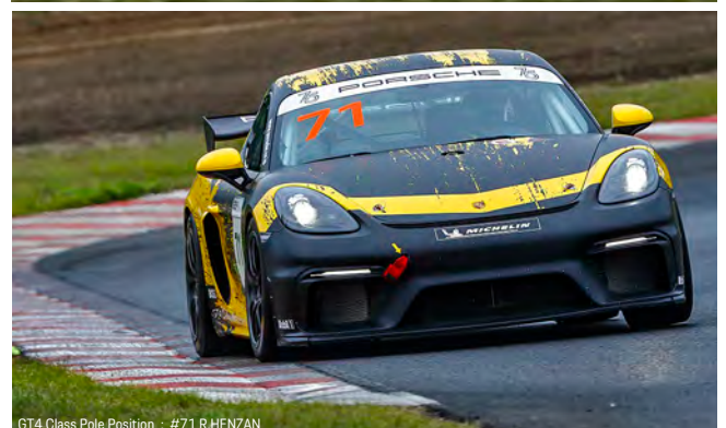
GT4 Class Pole Position : #71 R.HENZAN