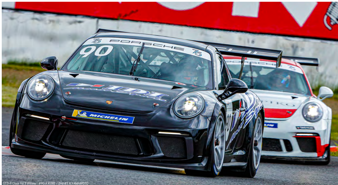
GT3-II Class Rd.3 Winner : #90 R.KURE / 2nd #1 K.YAMAMOTO

Started at 12:12 pm. / Weather : Sunny 20°C / Track : Dry 30°C