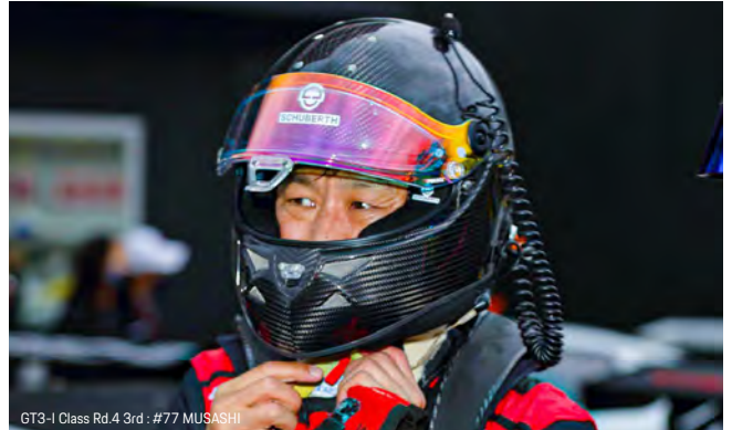
GT3-I Class Rd.4 3rd : #77 MUSASHI