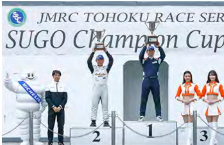
GT3-II Class Rd.3 : Top 2 Drivers