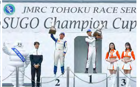
GT4 Class Rd.3 : Top 2 Drivers