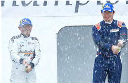
GT3-II Class Rd.4 : Top 2 Drivers