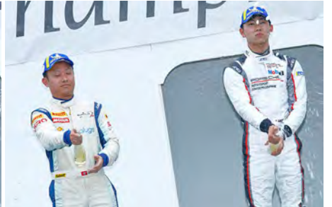
GT4 Class Rd.4 : Top 2 Drivers